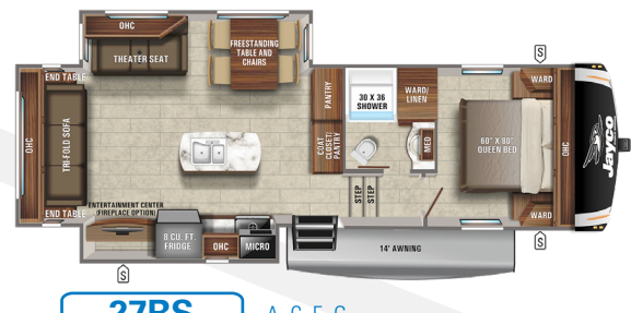
27RS A, C, E, G Ext. Lgth: 32' 8" Weight: 8,950 lbs. Hitch: 1,675 lbs.