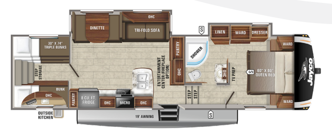
29.5BHOK A, D, E, F, G Ext. Lgth: 35' 1 " Weight: 9,290 Hitch: 1,740 lbs.