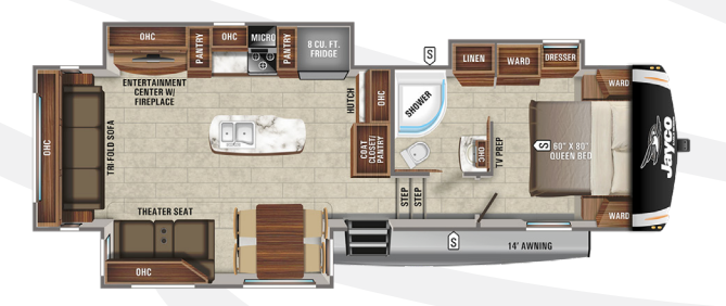
30.5CKTS A, C, E, F, G Ext. Lgth: 33' 11 " Weight: 9,430 lbs . Hitch: 1,805 lbs .